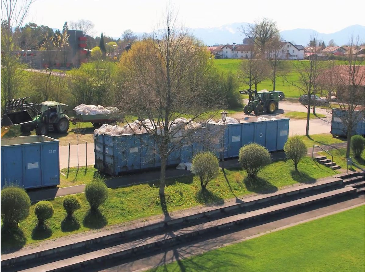
Separate collection of crop plastics at ERDE collection points throughout Germany.